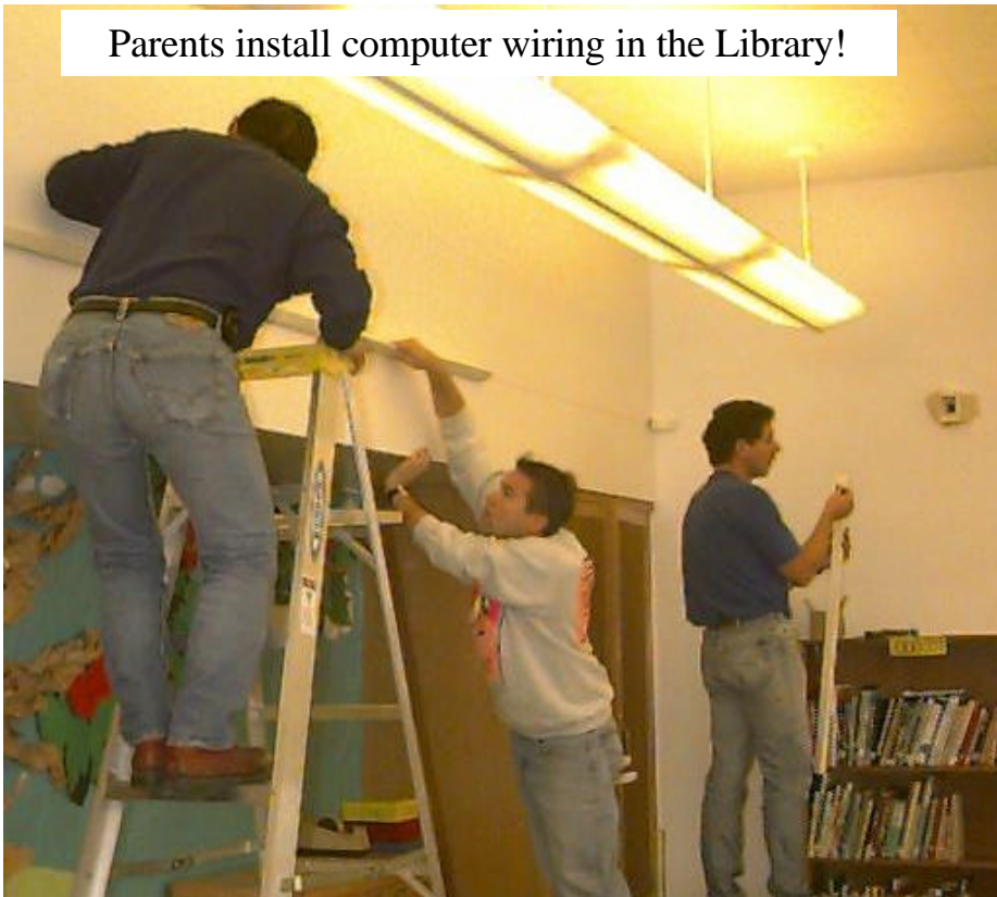
Parents install computer wiring in the Library!

Why did the turkey cross the road and roll in the dirt? Why did he cross the road again and roll in the dirt? Because he was a dirty double crosser!