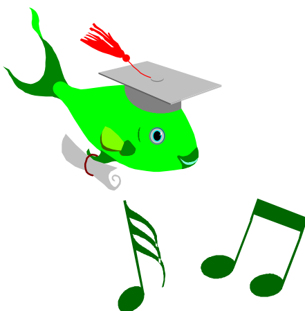
A sing-ray and a tuna fish!