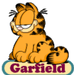
Because he's Sandy Claws!

Why did Garfield go to the beach dressed like Santa Claus?