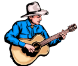
A picture of a cowboy.

What looks like a cowboy, sounds like a cowboy, but is not a cowboy?