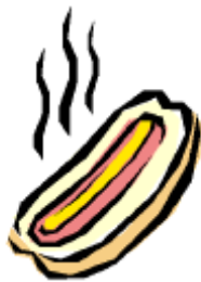
A hot dog!

What do you call a dog that's been in the sun too long?