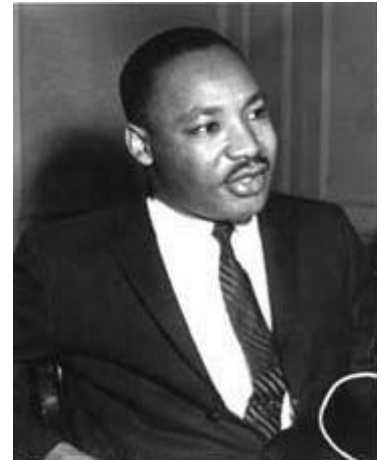
Martin Luther King Jr. in Seattle, Nov. 9, 1961.

We did a poem about Martin Luther King, "We Shall Overcome". We are writing about salmon. We are doing a story about salmon. We write in our journals what we do in the weekend.