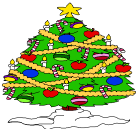
Have a winter break.