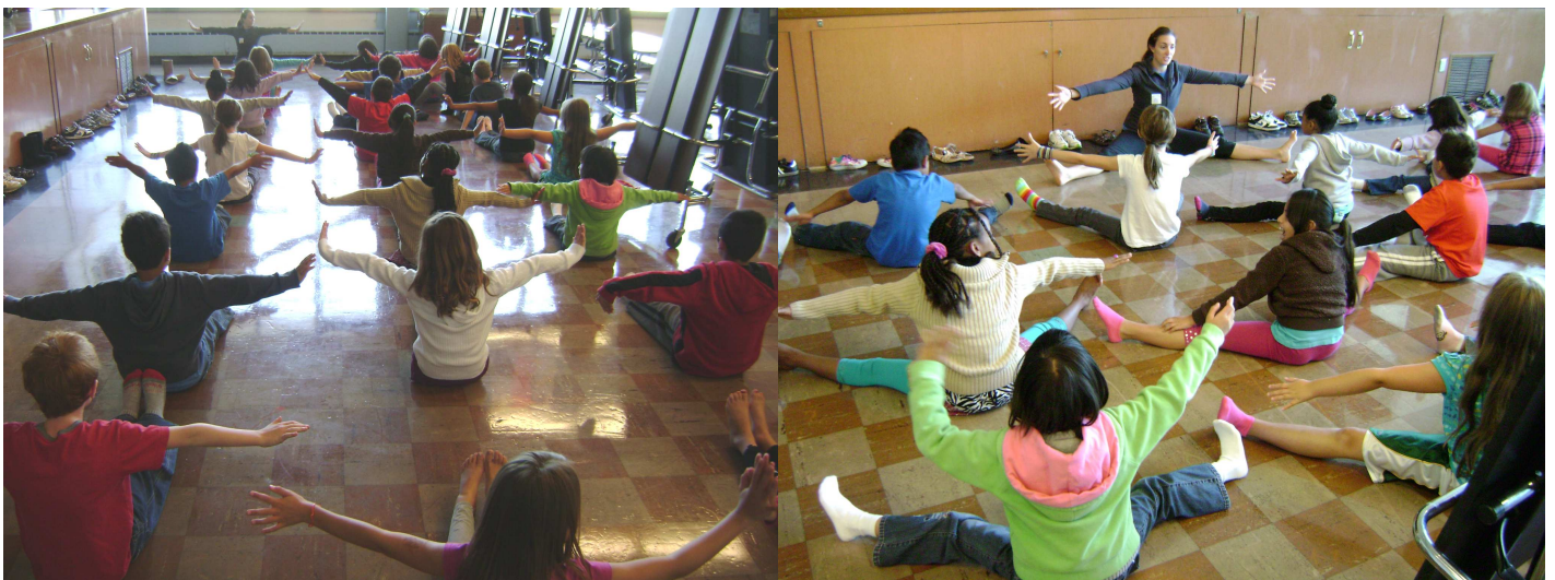
Third graders try out for Dance Chance with the Pacific Northwest Ballet!