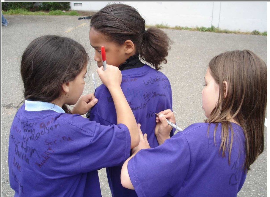
Autographing shirts on Young Authors' Day!

Q: Why is the math book so unhappy? A: Because he is full of problems!