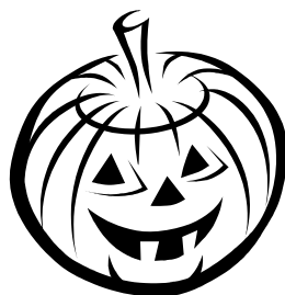
With a pumpkin patch!

How do you mend a broken jack-o-lantern?