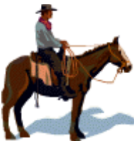
The horse was named Friday!

One Friday a guy rode on a horse to Canada. Three days later he rode back to Seattle on Friday. How is that possible?!