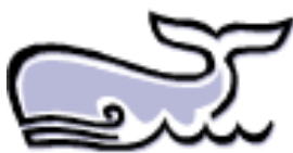
To get to the other tide!