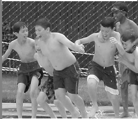
Third and fourth graders having a great time at Arbor Heights Pool!