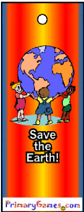
Earth Day Bookmark!